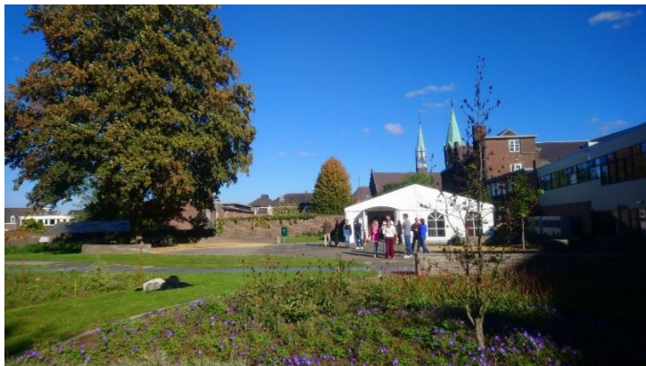
The FASoS garden

On Thursday, June 13 th , at 19:15, we kindly invite you to join us in the FASoS garden to enjoy delicious cocktails and a variety of delicacies from different food trucks. Meanwhile, we will prepare the Turnzaal for the dance party. We have ensured that your favorite dance songs are on the DJ's playlist.